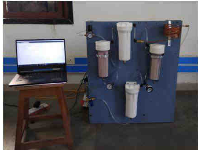
Fabrication of Oxygen Concentrator Prototype