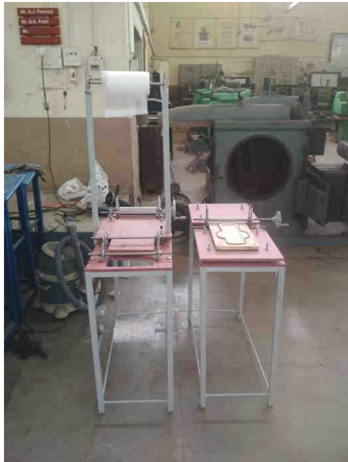
Prototype Development of low-cost sanitary pad manufacturing machine